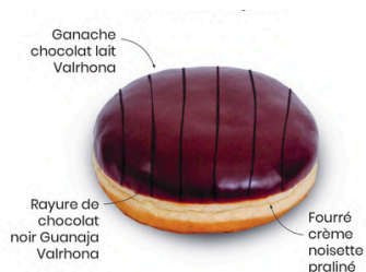
LE BUENO REVISITÉ Hazelnut cream with crunchy milk chocolate and dark chocolate drizzle