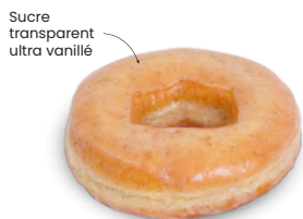
LE GLAZED Sugar and Madagascar vanilla