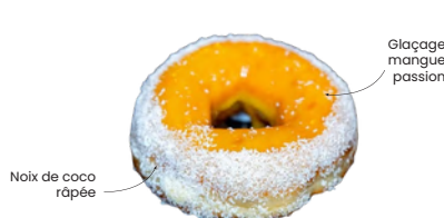
LE MANGUE COCO PASSION Mango passion fruit icing, coconut