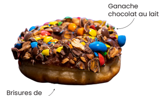
LE M&M'S Milk chocolate and M&M'S