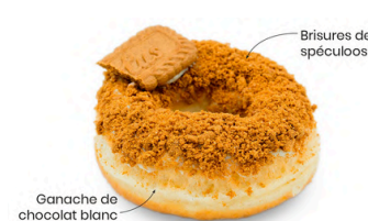
LE SPECULOOS Speculoos and white chocolate