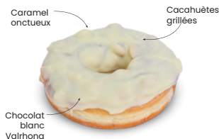
LE SNICKERS REVISITÉ Homemade salted caramel, peanuts and white chocolate