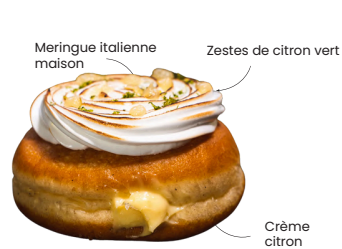
LE CITRON MERINGUE Lemon cream, homemade meringue and lemon zest